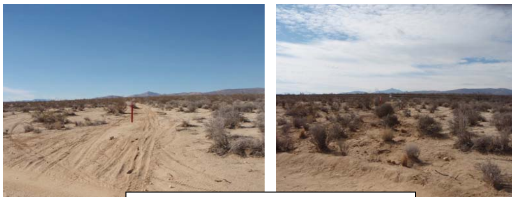
JB20-SC5-14 Before and After Restoration

In the Jawbone-Butterbrecht Area of Critical Environmental Concern and the Rand Mountains, the Ridgecrest Field Office, with the assistance of an SCA crew, monitored 47 sites; restored (e.g., rake, seed, plant) 44 sites within line of sight (over 3 acres); constructed 58 feet of barrier; and installed signs.