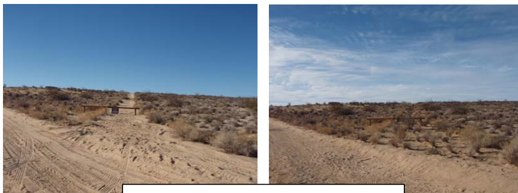
JB20-SC5-4 Before and After Restoration