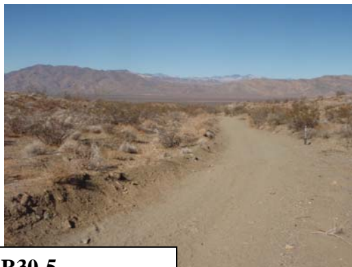
RM52-R30-5 Before and After Restoration