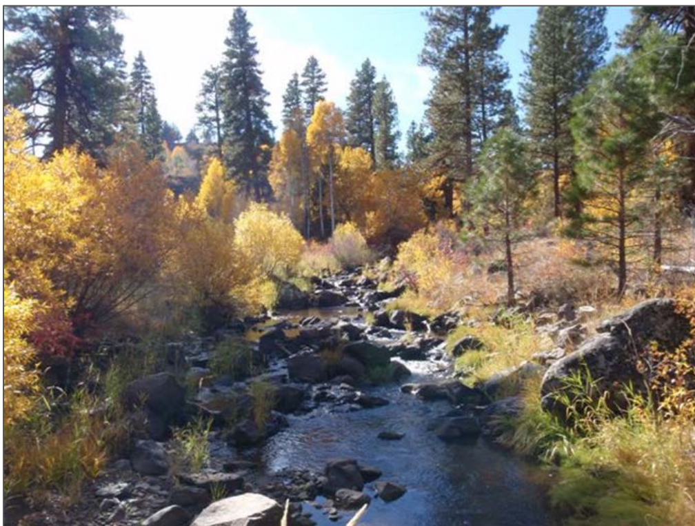
Twelve Mile Creek Lakeview District of Oregon and Washington BLM