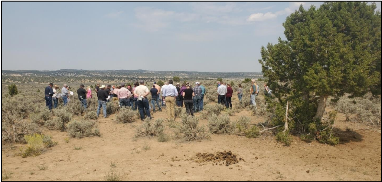
Tour participants hearing and observing the results of the range monitoring data conducted 2018 – 2021.

(1,060 horses + 20% annual population increase for 2021 & 2022 = 1,526 horses in 2022)