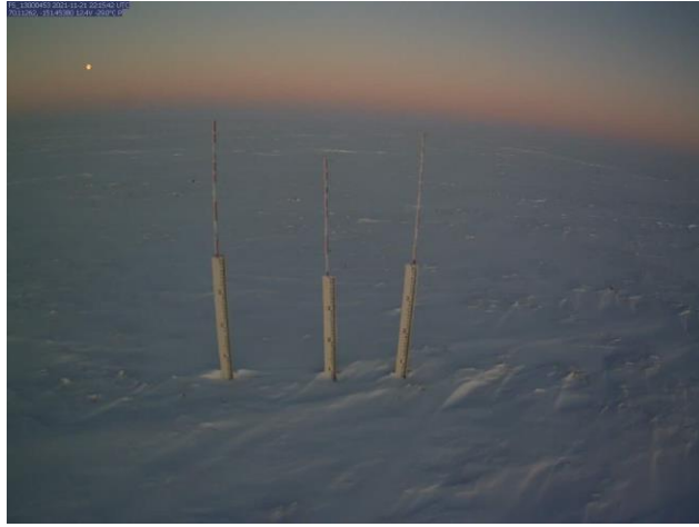
Photo taken 11/21/21 at Station H (Ocean Point) showing variability in snow depth cover: