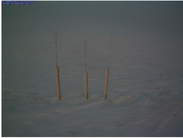
Photo taken 11/18/21 at Station H (Ocean Point) showing variability in snow depth cover: