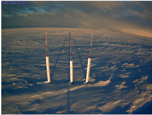
Photo taken 10/30/21 at Station H (Ocean Point) showing variability in snow depth cover: