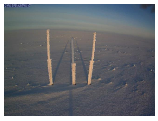
Photo taken 10/30/21 at Station H (Ocean Point) showing variability in snow depth cover: