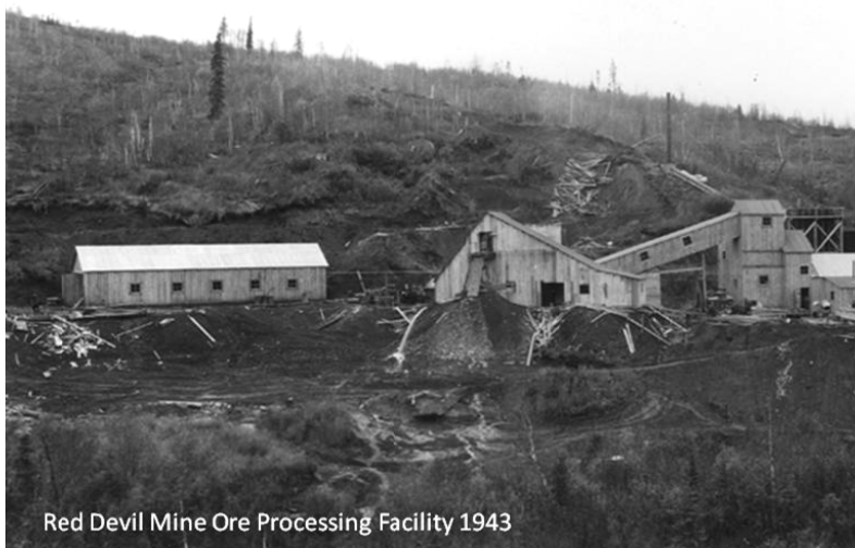
Red Devil Mine Ore Processing Facility 1943